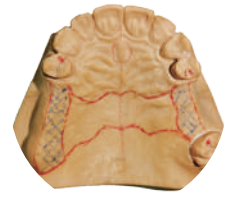
True color texture scan: 16s