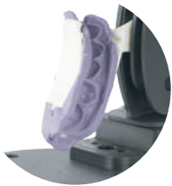
Triple tray: 70s