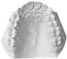
Full arch: 11s