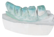
Unsectioned models scan: 14s