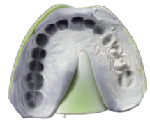
post&core scan: 33s